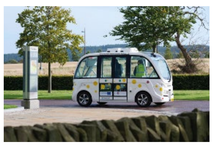
AV Pilot in operation at the Inverness Campus

We are also exploring the potential to extend the track to include more of the area that can be operated autonomously around Inverness Campus, with the view to assist traffic needs for staff and patients attending the new National Treatment Centre. We are also contributing to the AV Business Case report, analysing the cost-benefits of operating autonomous vehicles on a variety of routes around Inverness and studying best practice around Europe. In Orkney, we are extending our trial on Papa Westray until the PAV project ends on 1st March. This location has been selected due to the success so far and the potential to deliver goods between the market and the shop using a vehicle that has a higher payload, therefore acting as a good use case for the future. This will move us closer to establishing how these small AVs can work in remote and rural areas.