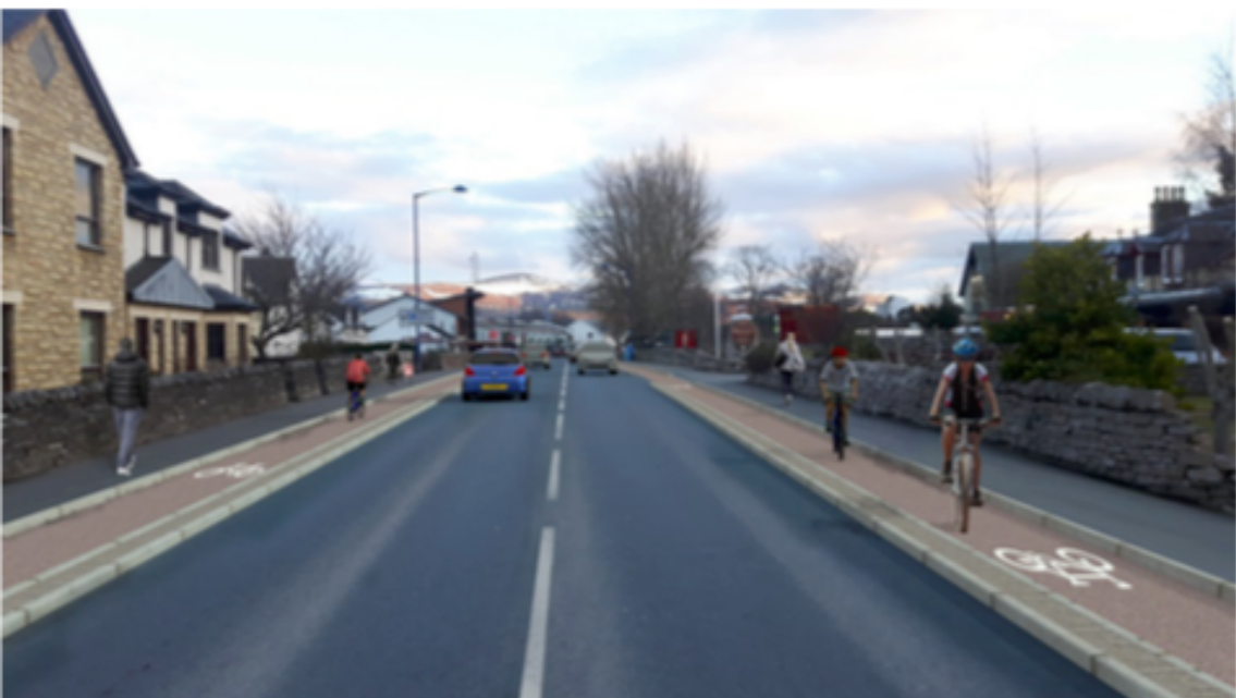
Figure 8.33 Before and After - Visualisation - Option 3

An example of the segregation options for Grampian Road, which was part of the public consultation is highlighted above.