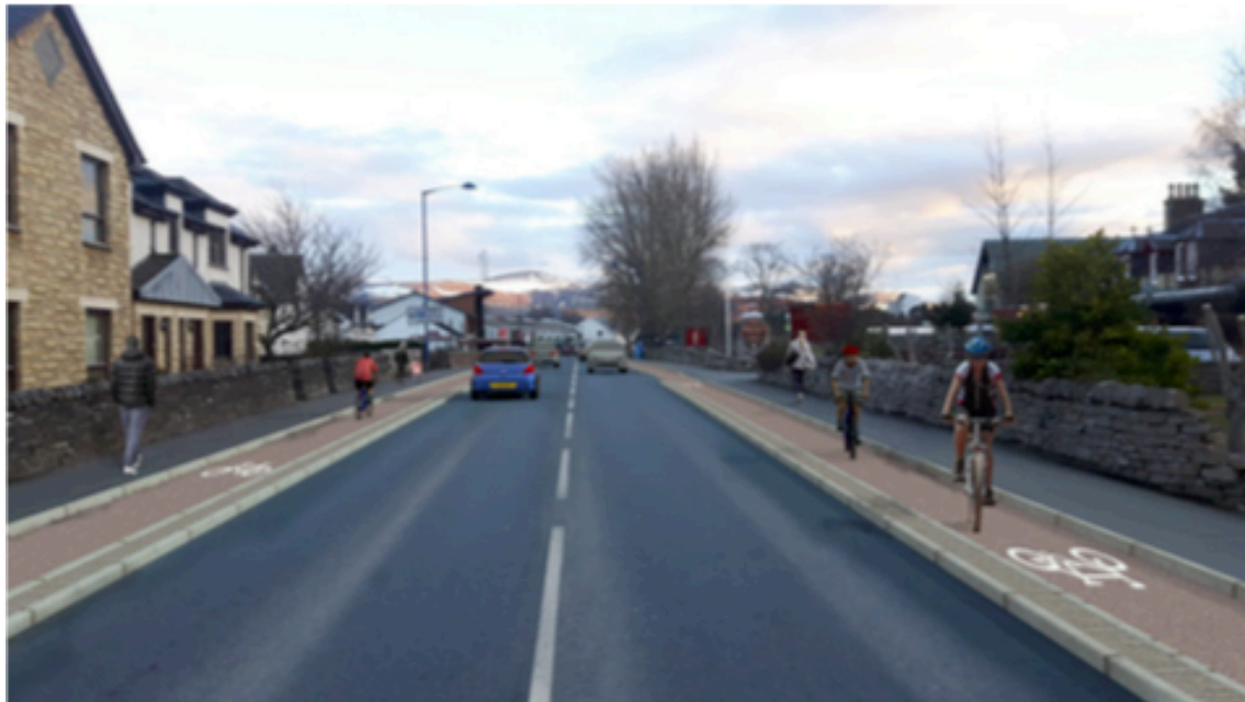
Figure 8.33 Before and After – Visualisation – Option 3

An example of the segregation options for Grampian Road, which was part of the public consultation is highlighted above.