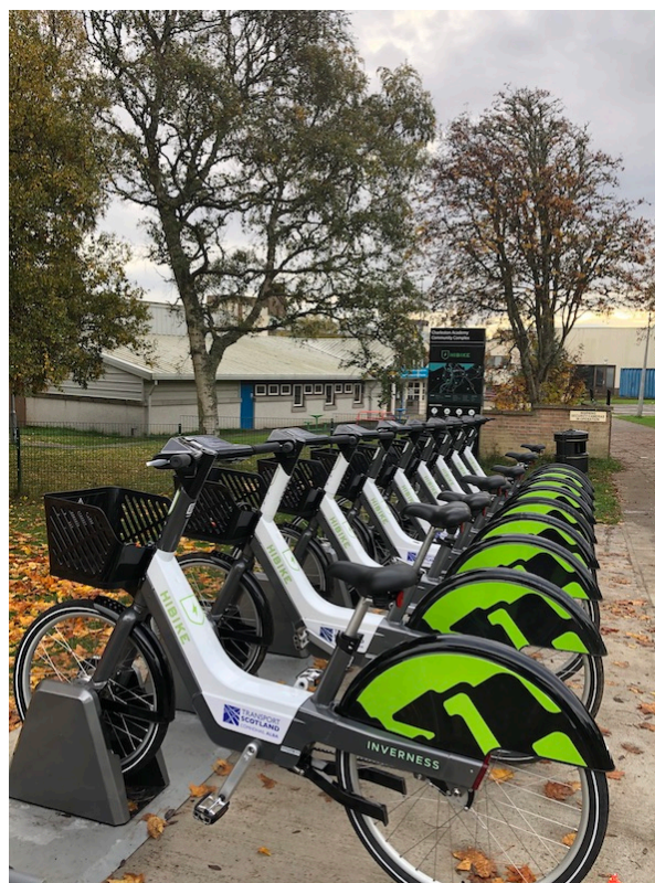
Photo: New HI-BIKE dock at Charleston Academy Community Complex

We are looking forward to seeing membership and rides increase as the scheme expands into more residential areas of the City.