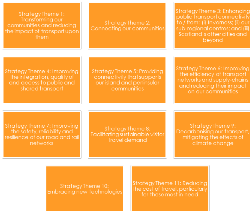
Figure 2.1: RTS Strategy Themes