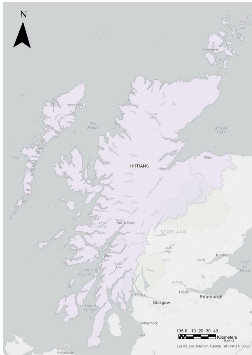
Figure 1.1: Our RTP area